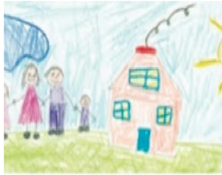
COMPASS Family Center

As part of the Adult Transition Study being funded by NFAR, COMPASS Family Center is presenting a seminar designed for parents of children age 14 or older who are preparing for transition to adulthood.